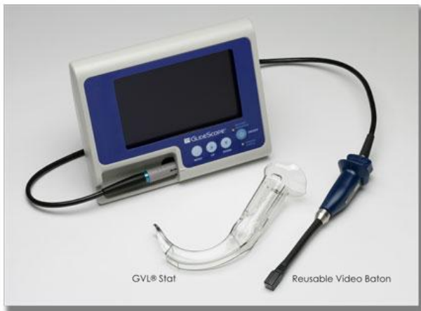
Figure 3. The GlideScope Cobalt, offering a disposable cover.