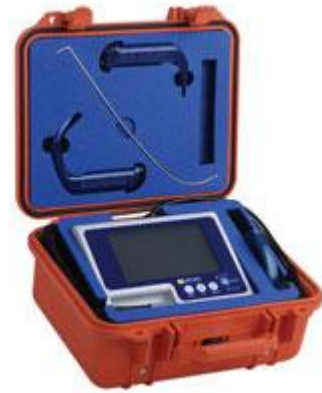
Figure 2. The GlideScope Ranger