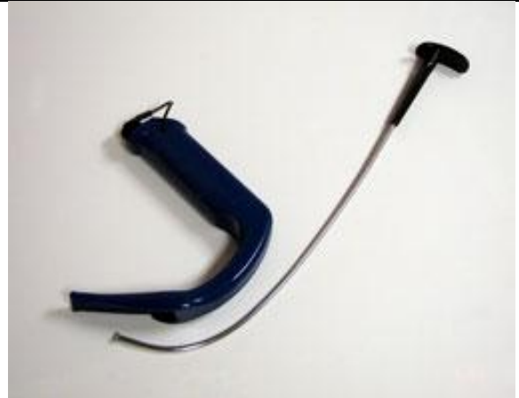
Figure 4. The manufacturer's recommended stylet.