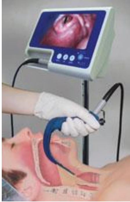
Figure 1. The standard GlideScope