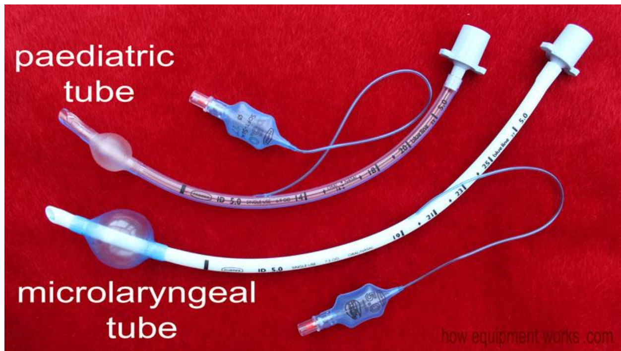
Figure 1. A typical microlaryngeal (MLT) endotracheal tube (bottom) with a pediatric endotracheal tube (top) for comparison. Such a tube typically has an inner diameter of 5 mm, compared to a conventional adult endotracheal tube with an inner diameter between 7 and 8.5 mm. While the small diameter of the MLT endotracheal tube allows improved surgical access to the glottic structures, in some cases even narrow bore endotracheal tubes such as the MLT interfere with surgical access to the glottic structures, necessitating the use of a tubeless anesthetic technique such as jet ventilation.