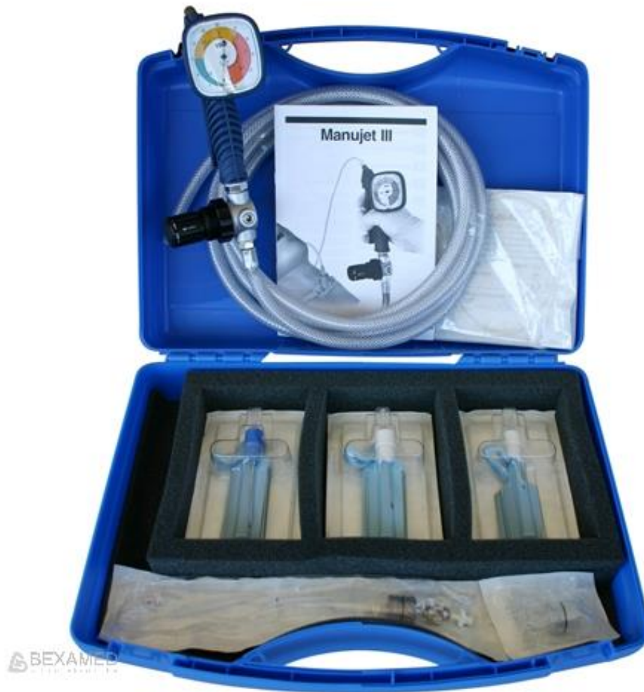
Figure 2. The Manujet III (VBM Medizintechnik GmbH, Germany) is a portable and easily adjusted medical device that can be used for manual jet ventilation. A color-coded gauge shows the proving pressure in bar and psi units. The gas driving pressure can be adjusted between 0 and 3.5 bar (0 to 50 psi). Note that 50 psi of driving pressure is in the range of 3500 cm H 2 O and so can readily produce barotrauma (e.g., a pneumothorax) if not used with caution. Most of the time a driving pressure in the range of 20 psi or less is used.