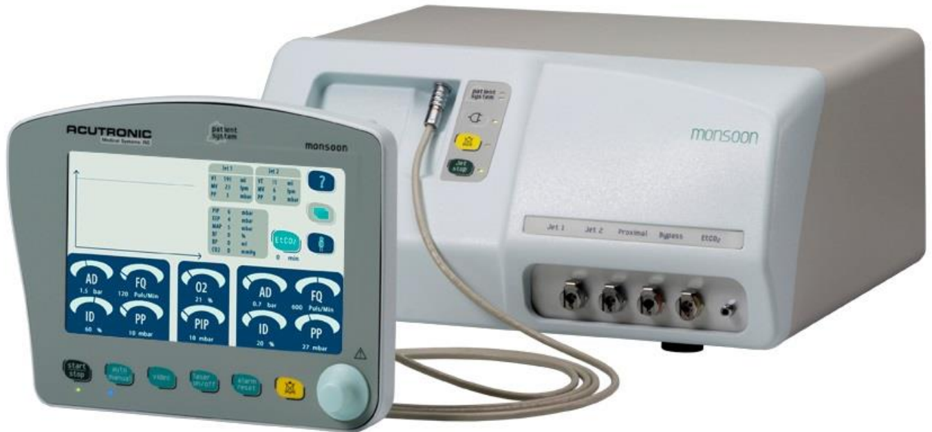
Figure 4. The Acutronic Monsoon III automatic jet ventilation system. Such systems are commonly used in conjunction with an infraglottic ventilation catheter (Figure 5). Table 1 lists a set of ventilation parameters that are commonly used with such a unit. Note that the ventilation rates for infraglottic automatic jet ventilation systems are usually much higher (in the range of 100 per minute and upwards) than for the supraglottic manual jet ventilation systems shown in Figure 2 (which typically operate in the range of 8 to 20 per minute).