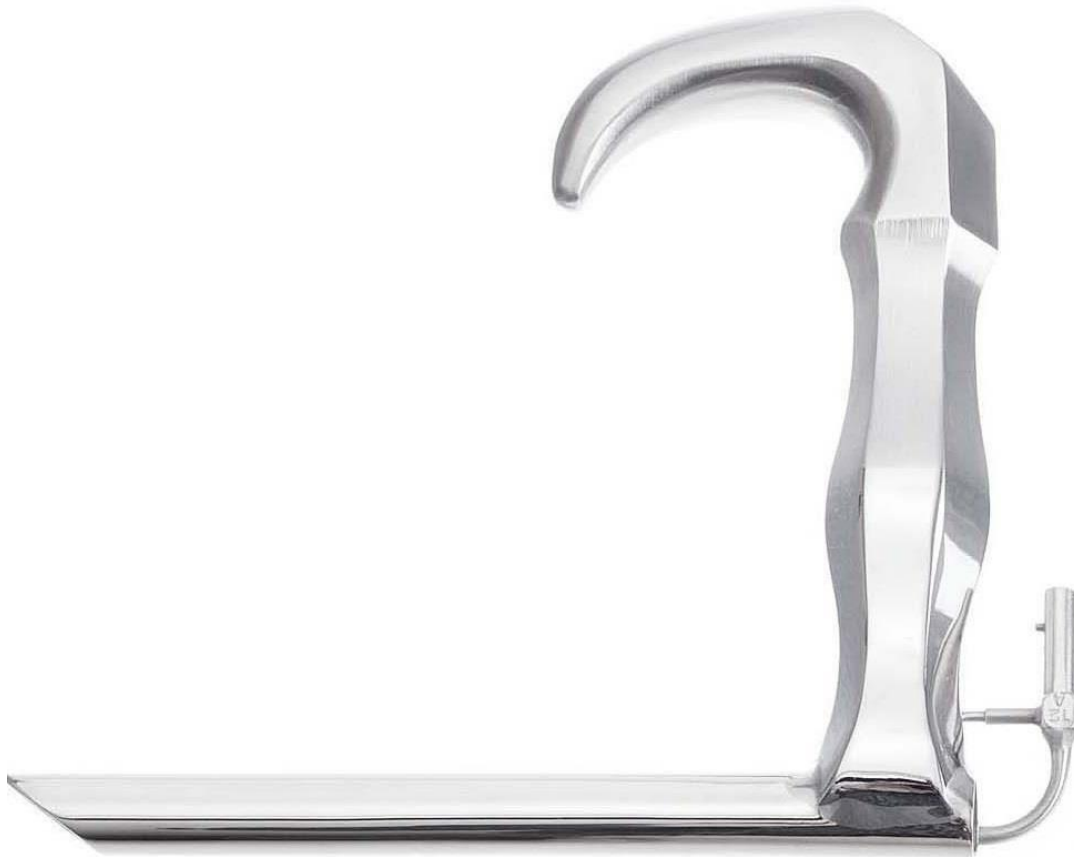
Figure 3. An anterior commissure laryngoscope for use in otolaryngologic procedures. Such laryngoscopes are commonly used in conjunction with a hand-held jet ventilator such as that shown in Figure 2, but in some cases jet ventilation can be avoided by using a narrow bore endotracheal tubes such as the MLT endotracheal tube (Figure 1).