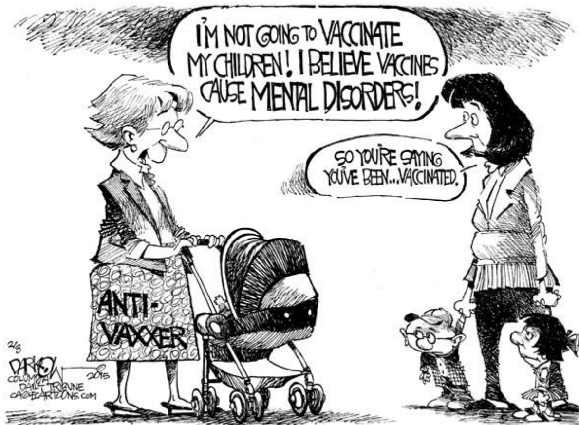
Figure 2. Sample editorial cartoon promoting vaccination.

http://themoderatevoice.com/wp-content/uploads/2015/02/159483_600-1.jpg