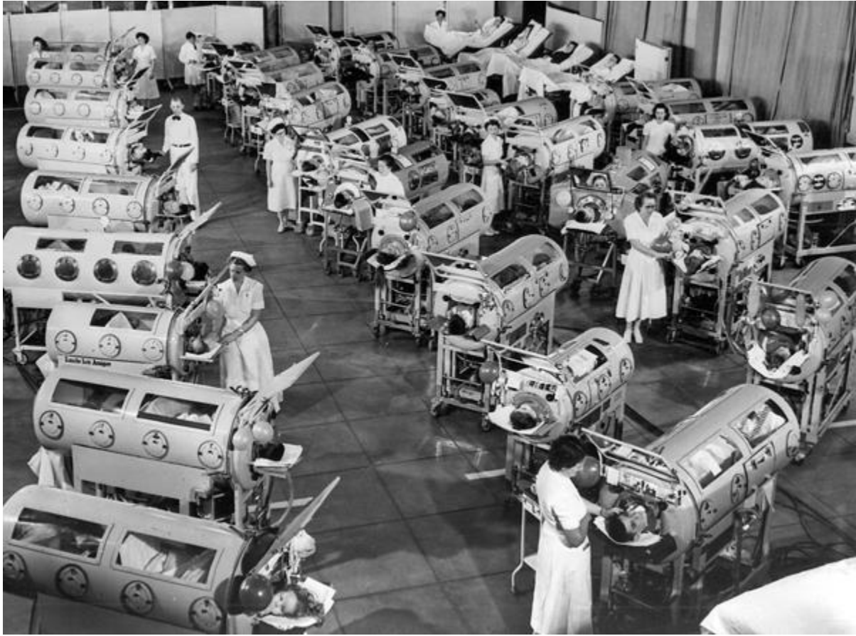
Figure 5. Image from the polio era (patients in iron lungs) promoting vaccination.

http://www.polioassociation.org/pictures.html