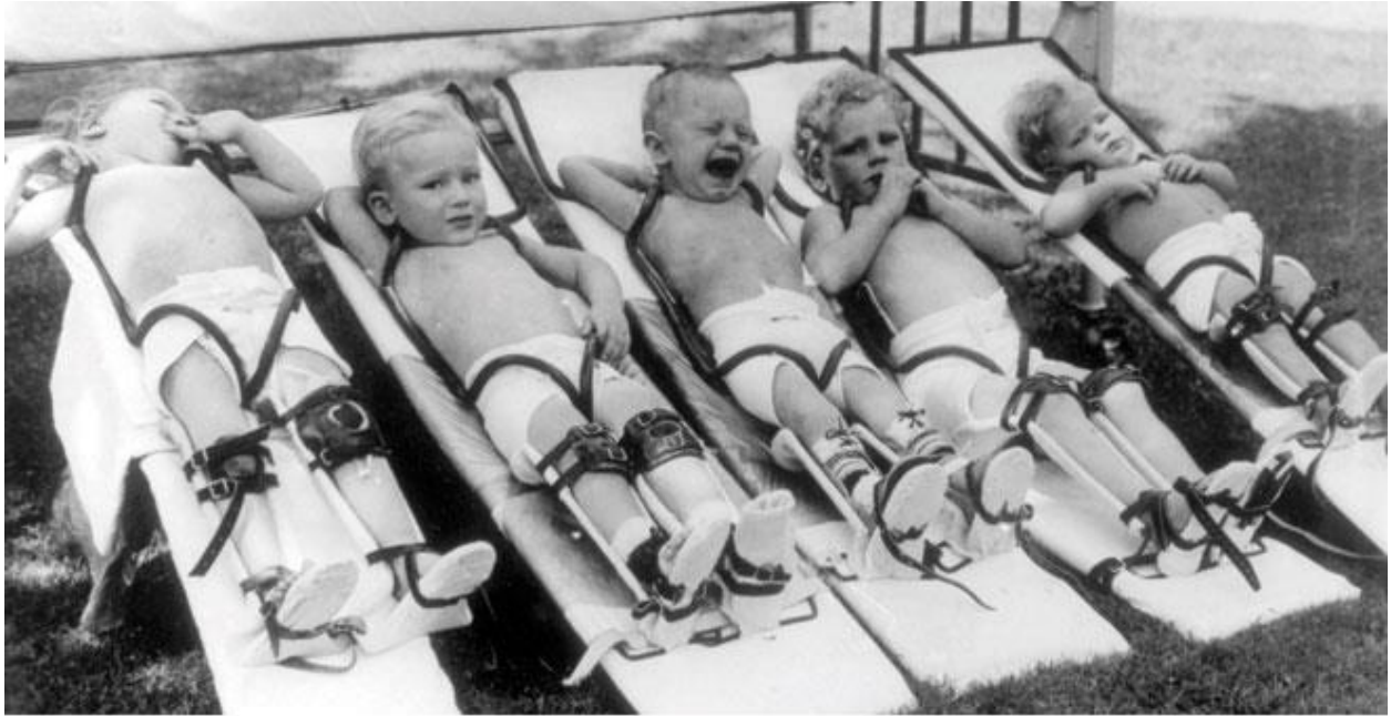
Young patients on boards at the Texas Scottish Rite Hospital for Children in Dallas.